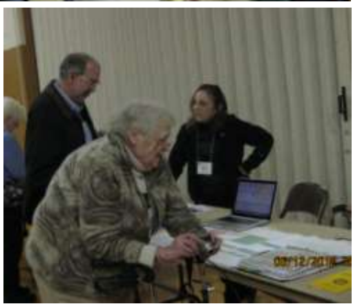
Page 3 Vol. 7, Issue 4