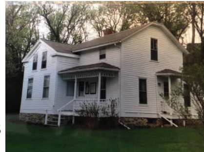
Luke Stoughton Pioneer Home

First stop- 1:30-2:20 : Our main museum is located at 324 S. Page St. Guided tours will be offered. Parking will be available at Livsreise lot on SW corner of Page St. and Main St.